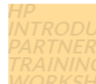
HP introduces partner training workshop 2007