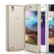
Gionee unveils Pioneer P2M smartphone priced