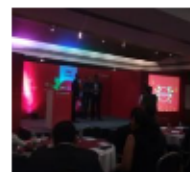
'SPARKLE', Canon - Pan India Roadshow conducted a meet