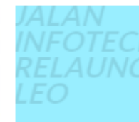
Jalan Infotech relaunched Leo